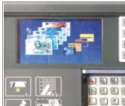
Optional graphic colour display for customer guidance gives fantasy a role in information.