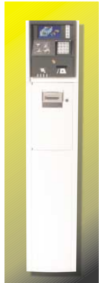
These pictures shows products with optional display and function keys.