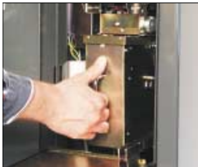
Unique cassette system for easy and safe money collection.