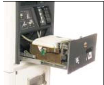
Easy accessible receipt printer with cutter and room for a large roll of paper.